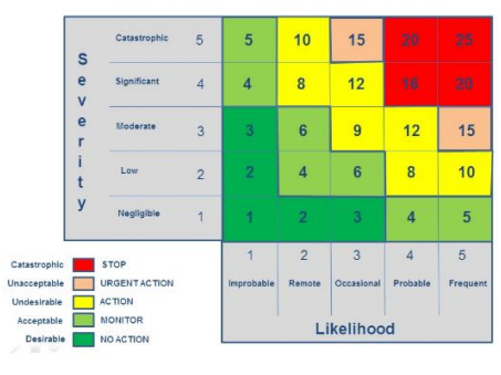
Figure 1: 2D Risk Assessment

The assessment that is currently the industry "best practices" suffers from two very dramatic limitations and weaknesses: